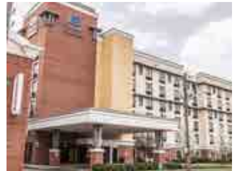
Comfort Suites City Centre Indianapolis, IN

The Comfort Suites is located in downtown Indianapolis, one block from Lucas Oil Stadium, home of the Indianapolis Colts. The marketing of the hotel was done under extreme confidentiality involving two national funds.