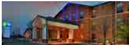
Holiday Inn Express Ramada Inn Batesville, AR

HB1 fielded dozens of offers in order to obtain the full asking price of this property. The hotel was unable to retain the franchise, and HB1 worked with numerous buyers and franchises to ultimately find the right fit for all parties.