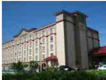
Best Western Orlando, FL

The hotel was Foreclosed and in default for seven years, and unsuccessfully marketed by several other brokerage firms. HB1 was able to negotiate lender approval and a contract to close the property in less than 60 days to convert the former Marriott into an Embassy Suites.