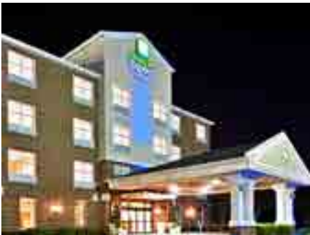
Holiday Inn Express Dallas, TX

HB1 fielded dozens of offers in order to obtain the full asking price of this property. The hotel was unable to retain the franchise, and HB1 worked with numerous buyers and franchises to ultimately find the right fit for all parties.