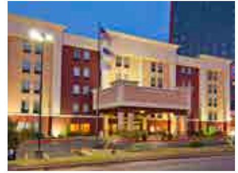
Hampton Inn Oklahoma City, OK

HB1 fielded dozens of offers, to eventually sell the property to one of the countries largest purchasing funds. The sale gathered one of the highest price/keys in the state of Oklahoma.