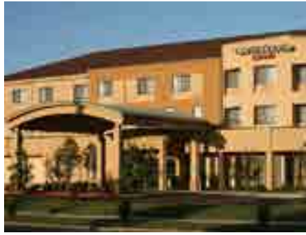
Courtyard by Marriott Norman, OK

This 185 room hotel was built and sold as a turnkey hotel. The hotel was shortly thereafter converted to the Hyatt Place New York Midtown South. HB1 began representation of the Seller during the initial construction phase and helped negotiate an outstanding price/key.