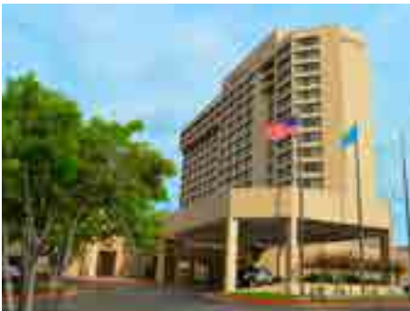
Former Marriott Oklahoma City, OK

The hotel was Foreclosed and in default for seven years, and unsuccessfully marketed by several other brokerage firms. HB1 was able to negotiate lender approval and a contract to close the property in less than 60 days to convert the former Marriott into an Embassy Suites.