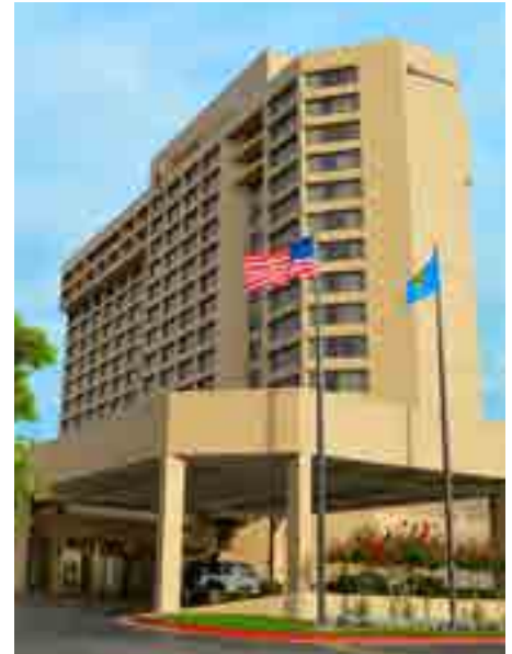
This 354 room former Marriott was sold by HB1 after other national brokerage firms had tried and failed.

For additional information visit our website at