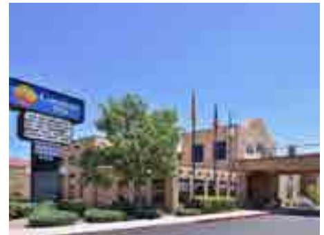
Comfort Inn Santa Fe, NM

In lieu of foreclosure, this national lender approached HB1 about the potential note sale . Through extreme confidentiality, HB1 was able to find a buyer that quickly purchased the defaulted note and mortgage.